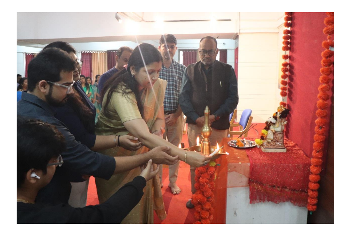
Lamp Lighting of Alumni Meet by Principal, Coordinator and Alumni.