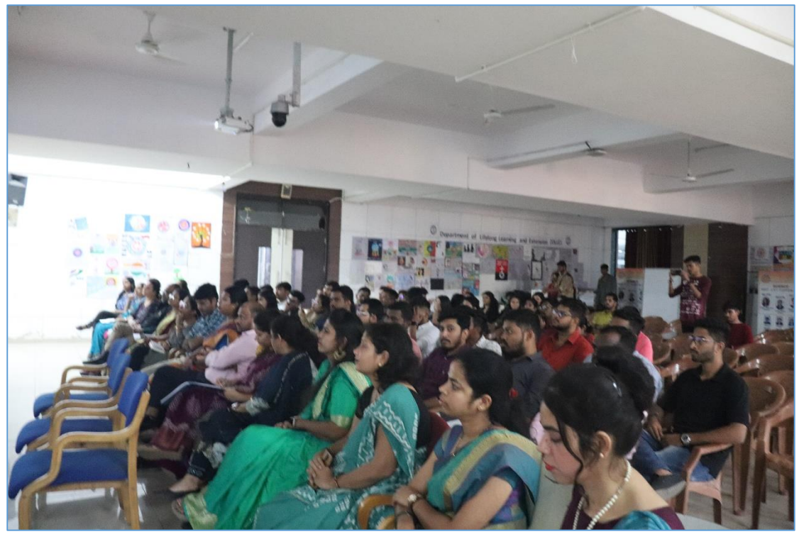
Gathering of Alumni and Faculties for the Alumni Meet-2024