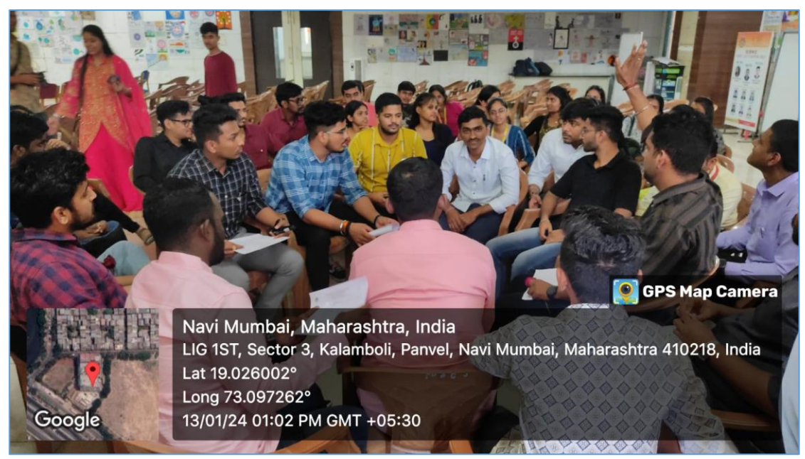
Discussion of Alumni for the Governing Body Constitution