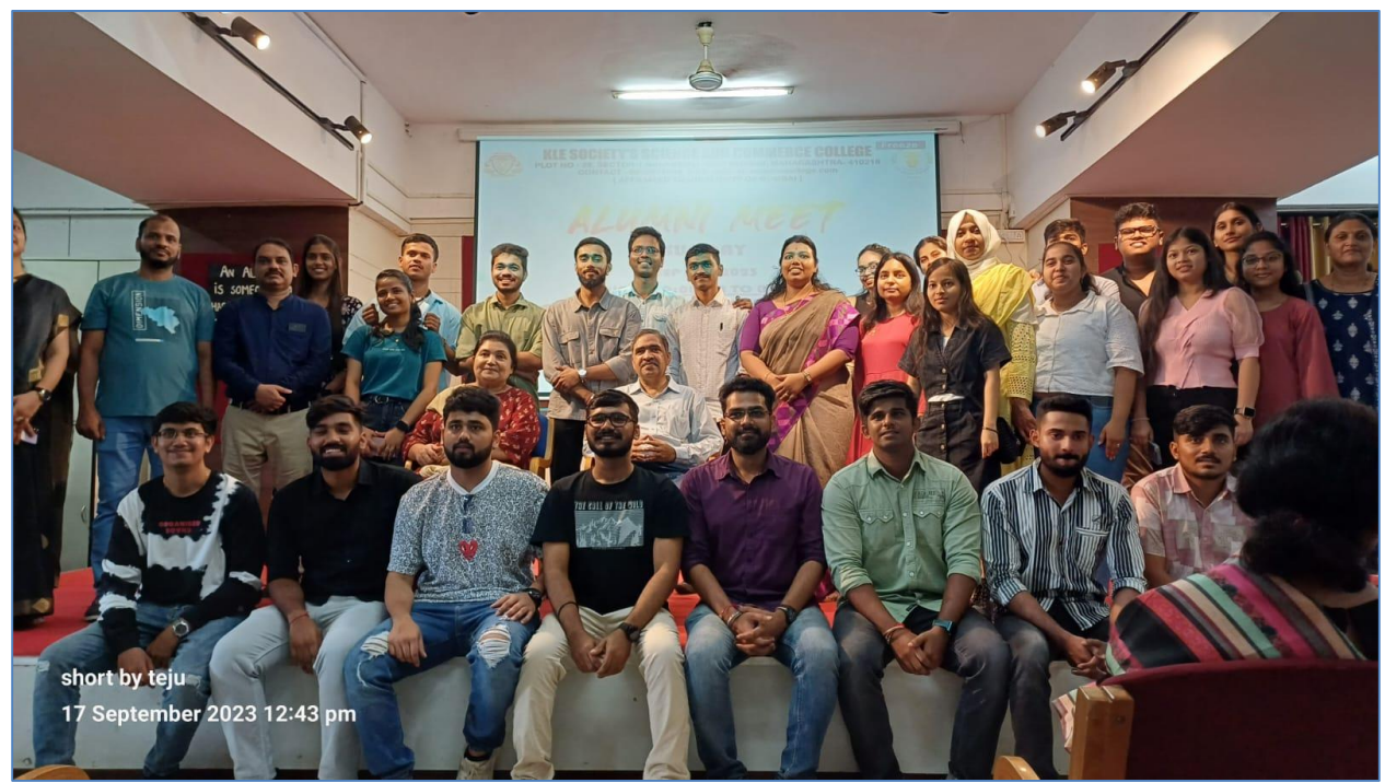
Gathering of Alumni.